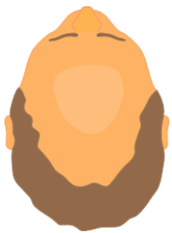
Typical Male Hair loss Pattern

Hair thinning and baldness cause psychological stress due to their effect on appearance. Although baldness is not as common in women as in men, the psychological effects of hair loss tend to be much greater.